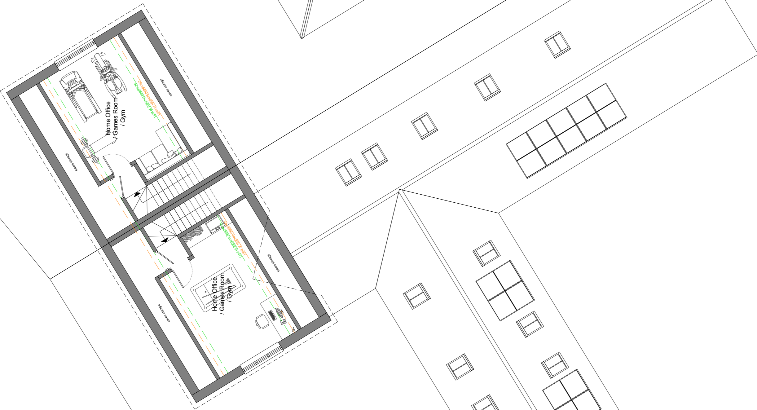
Plot 1 First Floor Plan 1:100